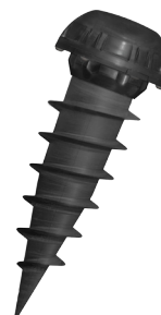
RDC Seismic Sensor Node