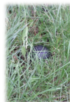
Covert seismic sensor: screw design (for minimal spoil) and discreet radio antenna